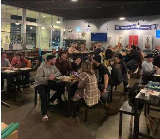
Teams participating in water trivia night using Ahaslides